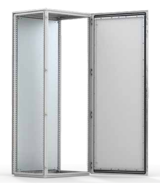
IP 55 | Type 3R | IK 10