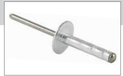
EN AW - 5052 [AlMg2,5]