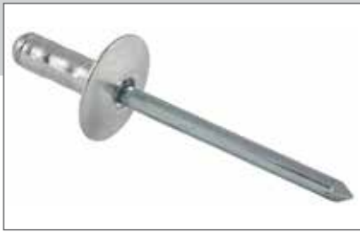
EN AW - 5052 [AlMg2,5]