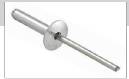
EN AW - 5754 [AlMg3]