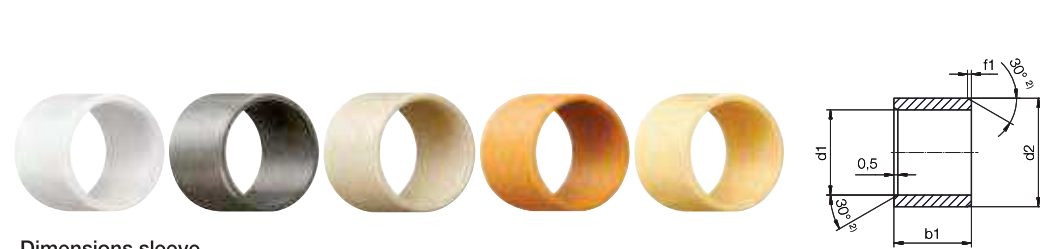
Dimensions sleeve Abmessungen zylindrisch [inch]