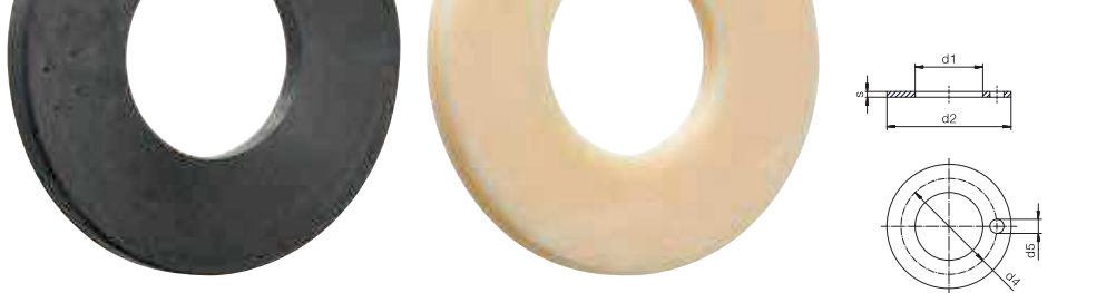
Dimensions thrust washer Abmessungen Anlaufscheiben [mm]