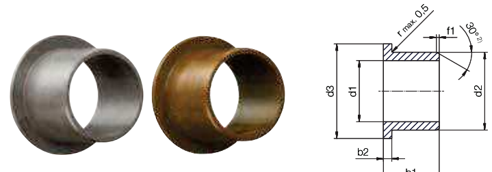
Dimensions with flange Abmessungen mit Bund [inch]