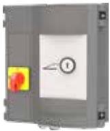
Classic Plus (standard)

The dock leveller is operated via the control system type Classic Plus included as standard. The components of the control system are RoHS-compliant (unleaded).