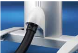
Mounting on pedestal CP 6141.100, see page 290