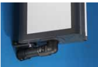
Mounting on Compact Panel CP 6340.000 - .420, see page 231