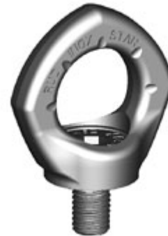
Eye bolts made out of DUPLEX stainless steel

This safety instruction/declaration of the manufacturer has to be kept on file for the whole lifetime of the product. Translation of the Original instructions