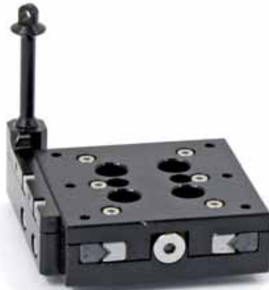
Application example: Anodized black with positioning pin and guide mounted