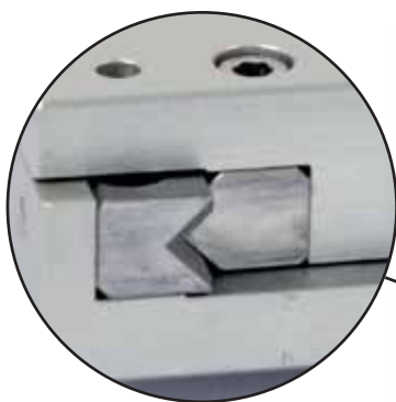
Version with slide bearings